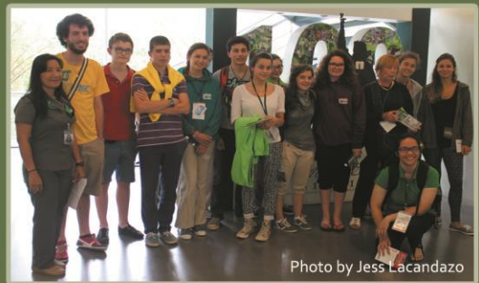
French Lasallian volunteers and De La Salle Philippines staff, July 21, 2014. Twenty-seven (27) French Lasallian volunteers toured the Institute, including the library.